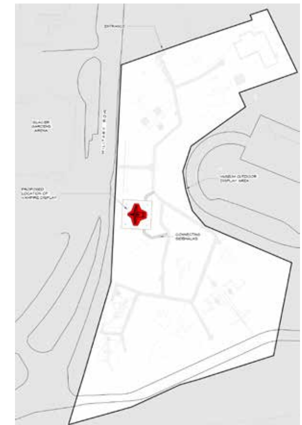
Vampire's placement in the Heritage Air Park.