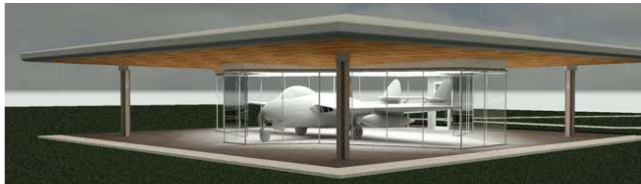
Architect's rendition of final construction.

To mark the centennial of the Royal Canadian Air Force in 2024, 19 Wing and the Comox Valley Air Force Museum Association are fundraising to construct a pavilion to house the DeHavilland Vampire Mark III, tail number 17031. The aircraft is currently being stored on the Base away from public sight.