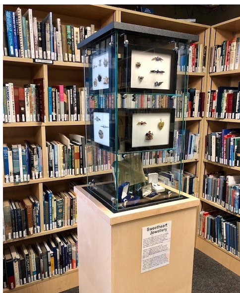
A new permanent display in our library highlights our Sweetheart Jewellery collection.

Ongoing Organization and Cataloguing of Collections