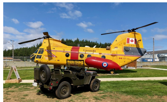
Our Heritage Air Park, aircraft and vehicles require constant upkeep and maintenance.

Help us to continue our work preserving RCAF history and heritage by making a donation today!