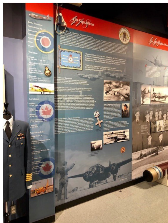
418 Squadron is the newest addition to CFB Comox. The permanent display of their history is nearing completion in our gallery.